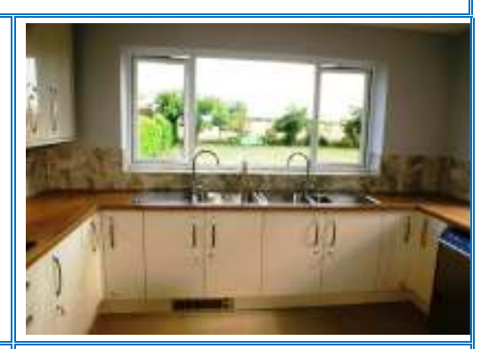
View through rear window of Kitchen