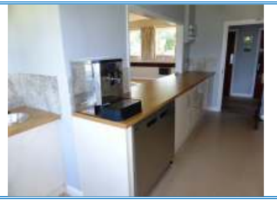
Burco auto boiler, Warming Cupboard & spacious Servery

Aylesbury Vale Community Chest, is a community grants scheme run jointly by Aylesbury Vale District Council & the Vale of Aylesbury Housing Trust