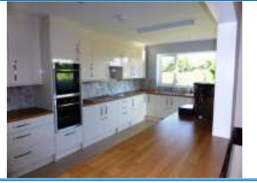
View through servery from hall - double Neff Ovens & Neff Induction Hob

On 3<sup>rd</sup> September 2018 the extended and totally refurbished Kitchen was opened - making it probably the best village hall kitchen in Bucks, Beds & Herts!