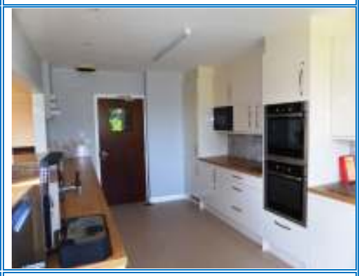
View towards kitchen door – double Neff ovens; Microwave & Fridge Freezer