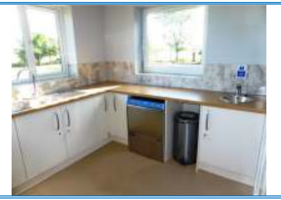
Commercial Dishwasher & hand wash