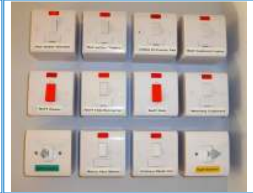
The master switch board to help make it as easy as possible for Kitchen users new to the Hall