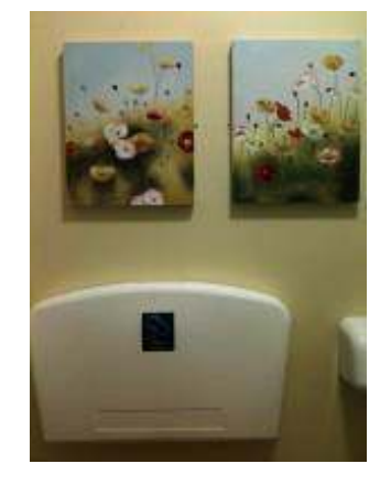
Baby Changing Facilities