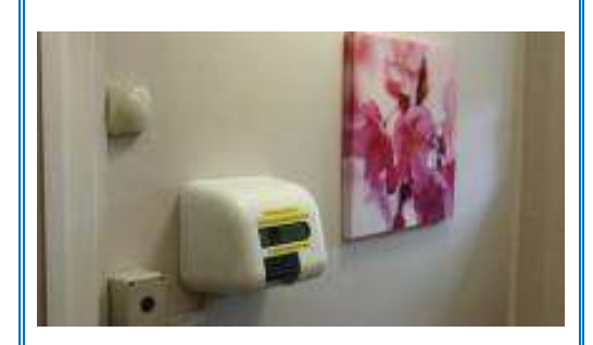
The Ladies Toilets are especially bright and well equipped