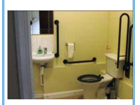
Wheel Chair Accessible Toilet

NVT believes that the toilets are now among the best available in any village hall.