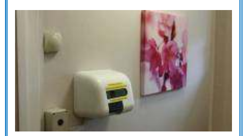
The Ladies Toilets are especially bright and well equipped