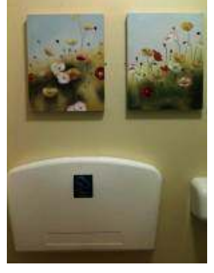
Baby Changing Facilities