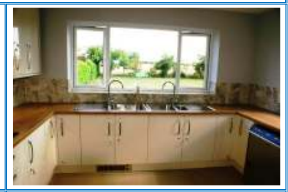
View through rear window of Kitchen