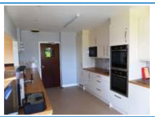
View towards kitchen door - double Neff ovens, Microwave & Fridge Freezer