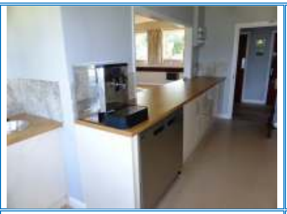
Burco auto boiler, Warming Cupboard & spacious Servery

Aylesbury Vale Community Chest, is a community grants scheme run jointly by Aylesbury Vale District Council & the Vale of Aylesbury Housing Trust