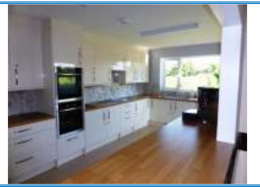
View through servery from hall - double Neff Ovens & Neff Induction Hob

On 3<sup>rd</sup> September 2018 the extended and totally refurbished Kitchen was opened - making it probably the best village hall kitchen in Bucks, Beds & Herts!