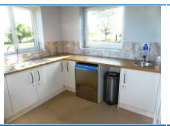
Commercial Dishwasher & hand wash