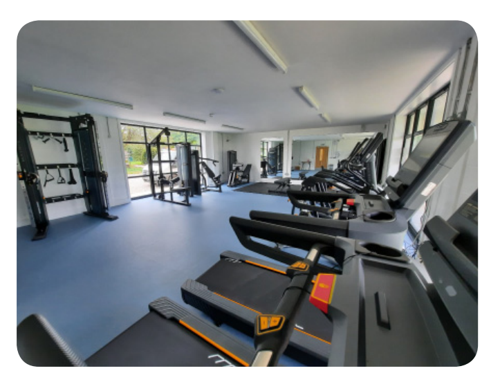
A super Gym with ten pieces of the latest equipment