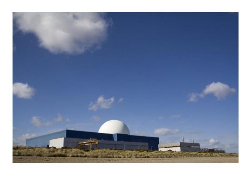
Sizewell B 4.5 years to decide