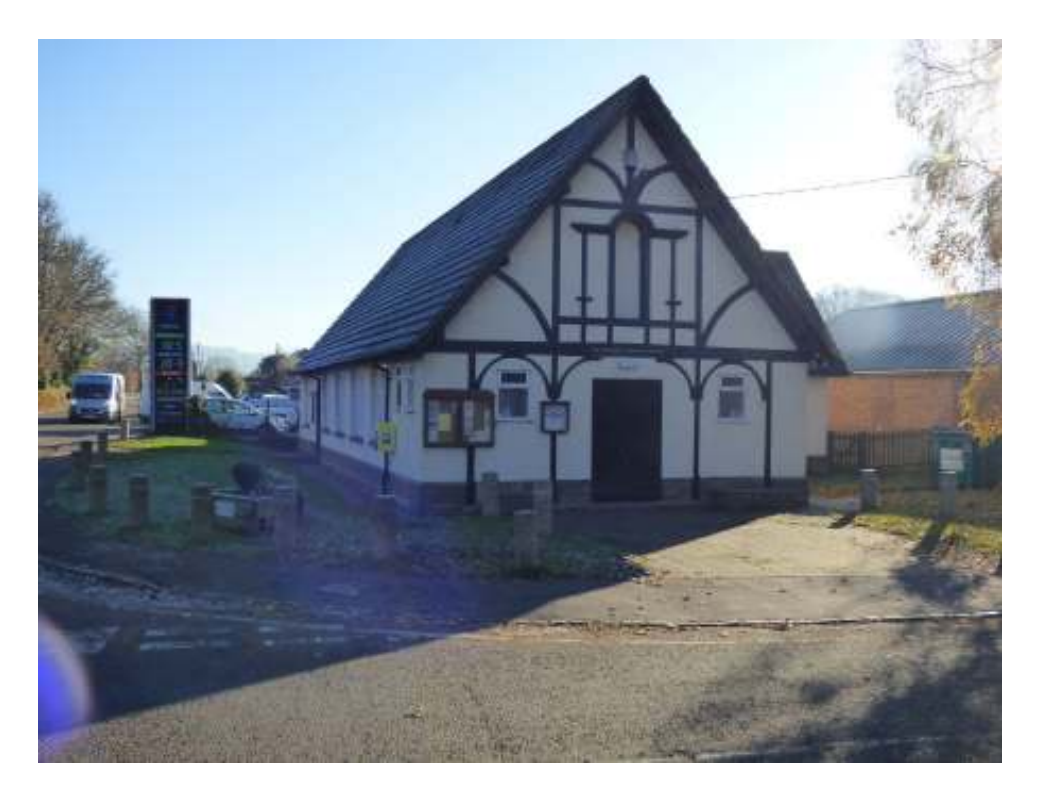
The hall is the community hub for the village.