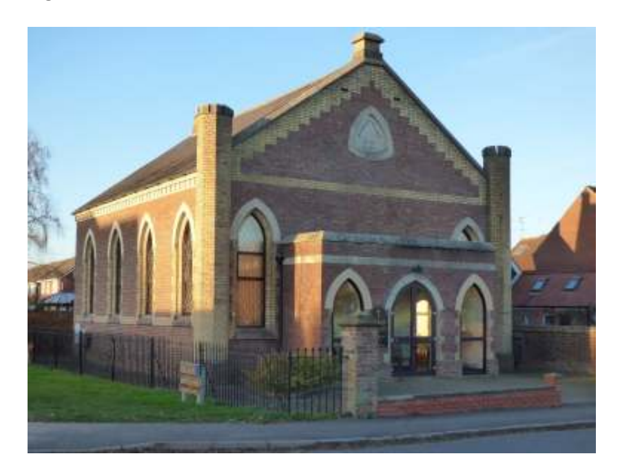
The chapel was built in 1858.