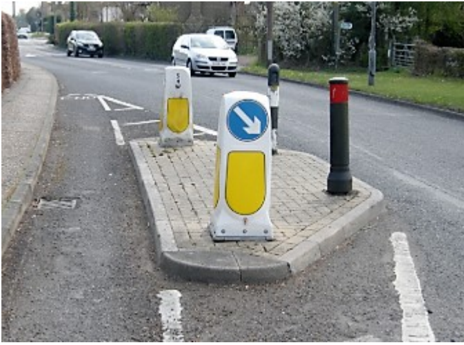
This is an example of a build out.