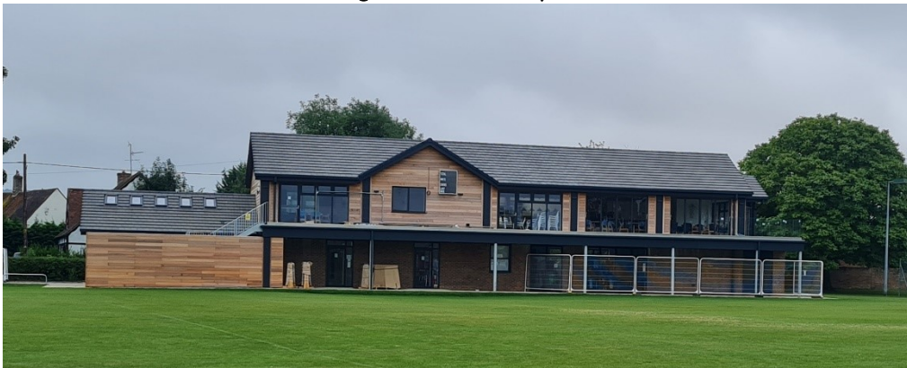
Edlesborough Pavilion in September 2021