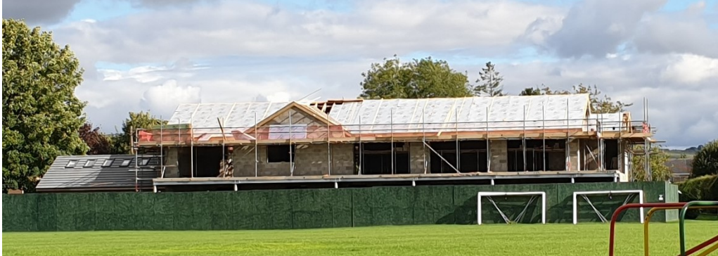
Edlesborough Pavilion in September 2020

More information about membership of the ECSC can be found at https://escomembers.azurewebsites.net/ Once the Pavilion is open EPC will deliver an informative leaflet to all homes in the Parish about the project.