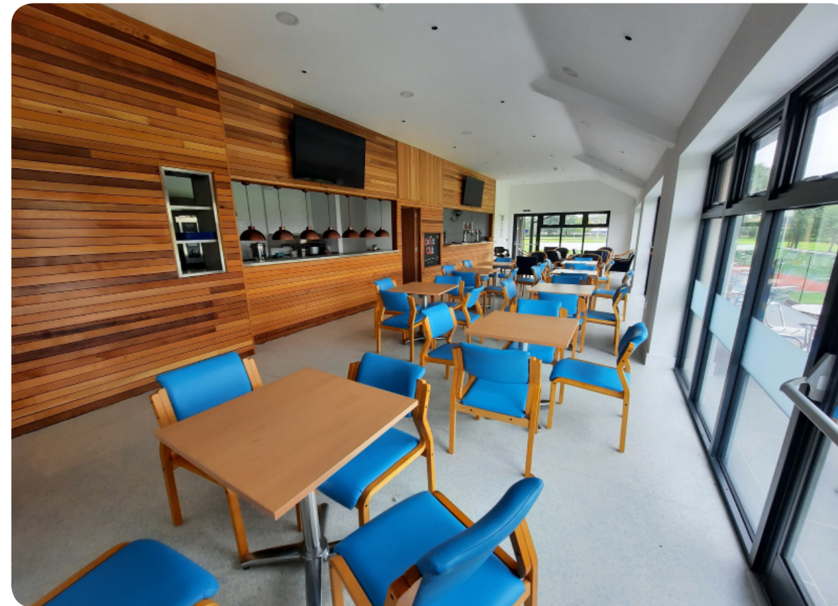
Community Hub Club room with bar, catering and 2 TVs for Sky Sports. Access to balcony with its wonderful views over the Green