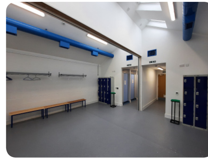
2 changing rooms each with 3 showers and 2 toilets (with removable wall opened)