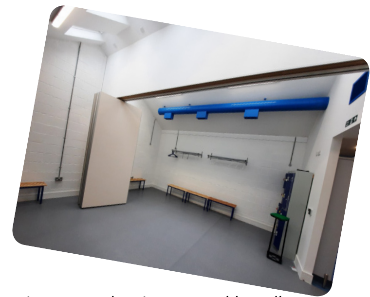
Changing rooms showing removable wall to create a larger activity space