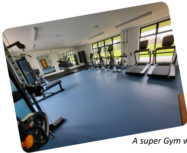
A super Gym with ten pieces of the latest equipment