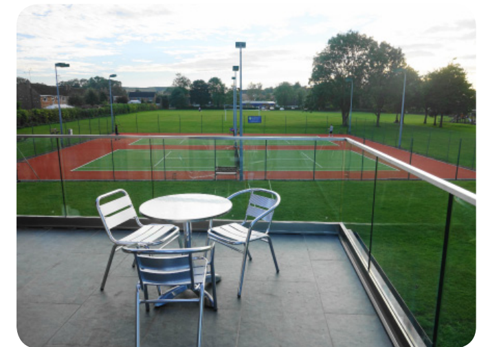
Additional Pavilion facilities include: Officials/ treatment room; wheel chair accessible toilet & shower; toilets on ground & first floors; club manager's office; servery; parking for 28 cars; enclosure for goal posts etc. & other storage rooms