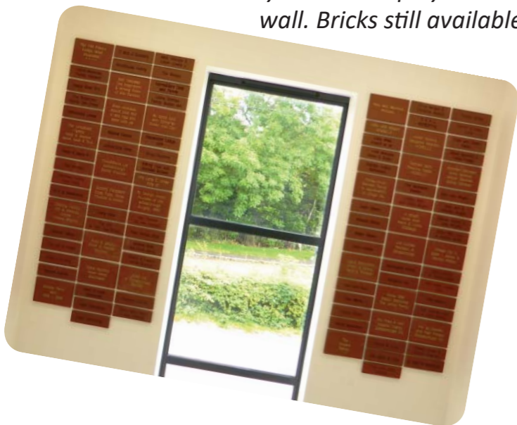
'Buy a Brick' displayed on the staircase wall. Bricks still available for sale!