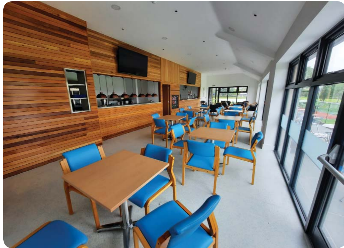
Community Hub Club room with bar, catering and 2 TVs for Sky Sports.