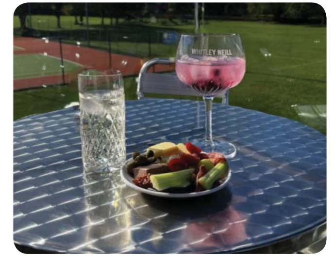
Enjoy a drink and snack on the balcony