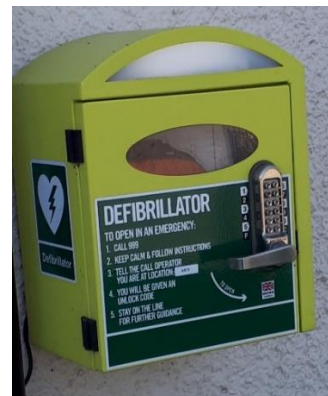
CPR & AED Course

The hatch is open when football matches take place on the Green