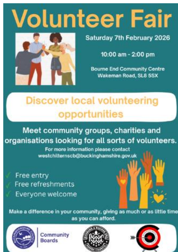
5 - Discover volunteering poster

Penn, Tylers Green & Loudwater: Improve social community connectedness by working with stakeholders to address community needs, focusing on young people in Loudwater.