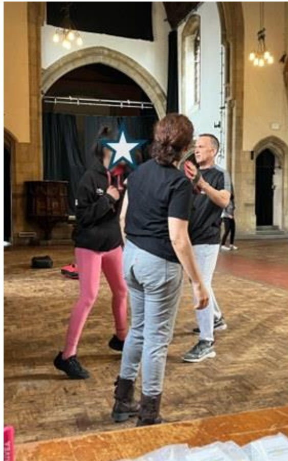
12 - Self Defence Class