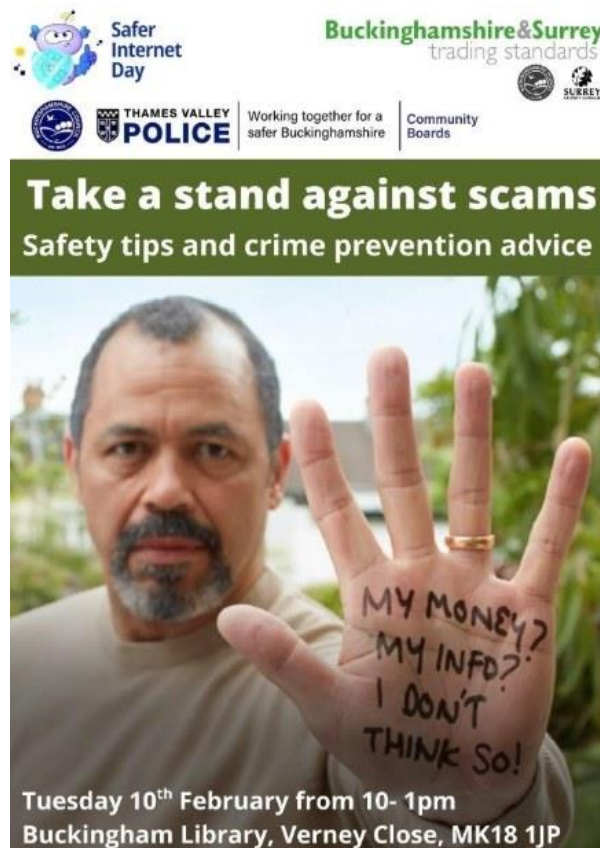
10 - Scam Awareness Flyer

Buckingham, Horwood and Newton Longville: Map public and community transport services, acknowledging that communities in North Bucks rank highly for time taken to travel to GP services and village/town centres.