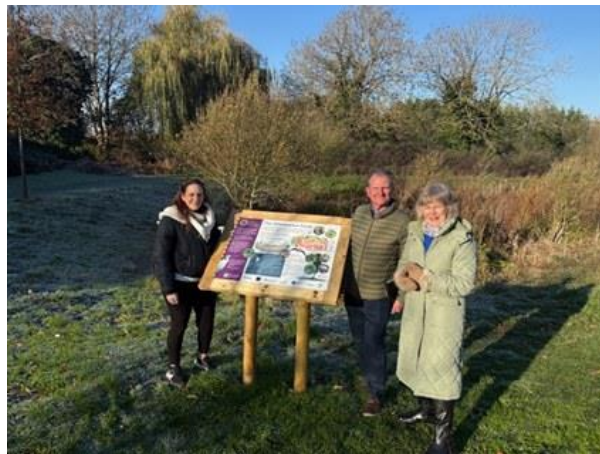
8 - Wild Estone Noticeboards