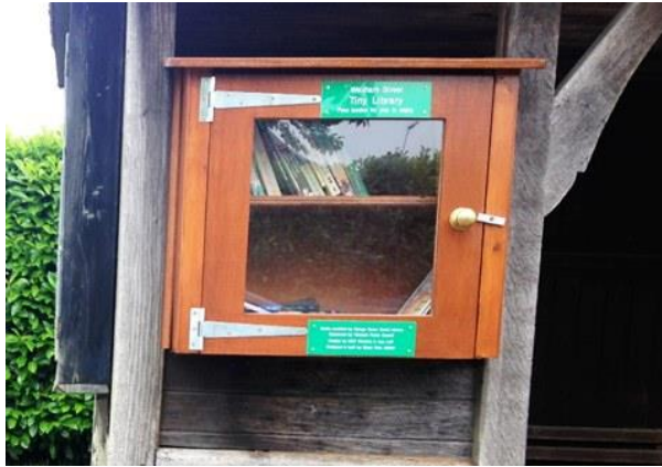
2 - Little Library