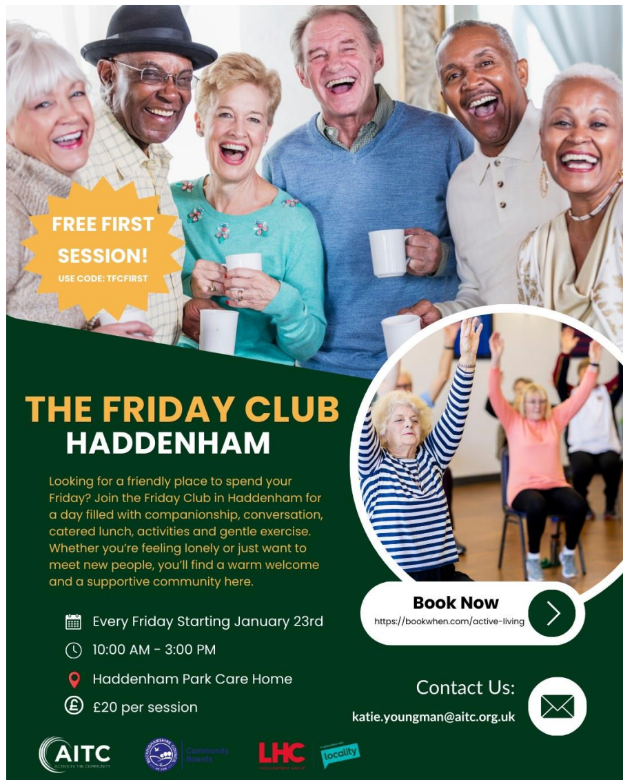
9 - The Friday Club