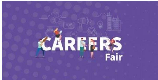
3 - Careers Fair Sir William Ramsay