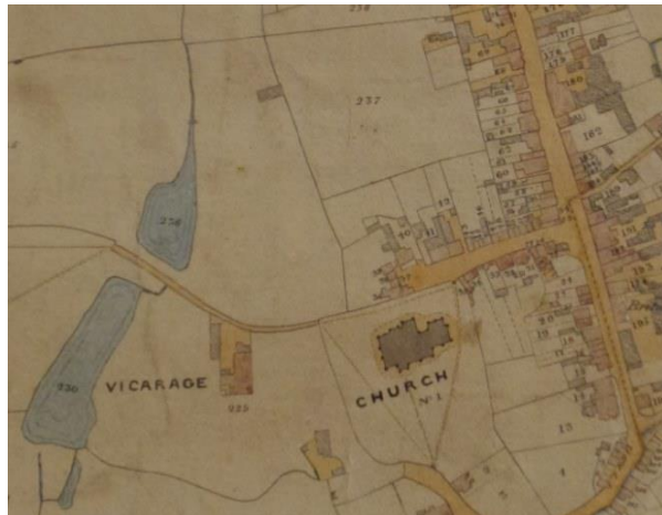
1 - Original map of The Pond at Lent Rise

Chalfont St Giles & Little Chalfont: Work with partners to harness local heritage and to highlight natural features such as Chalk Streams, to promote the villages as vibrant destinations.