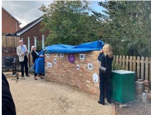
11 - Garden Unveiling