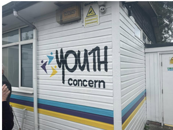
13 - Youth Concern

Aylesbury East: Build positive intergenerational relationships and improve social perception between age groups in Bedgrove.