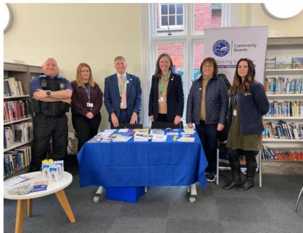
6 - Scam Awareness session