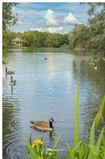
14 - Watermead Lake