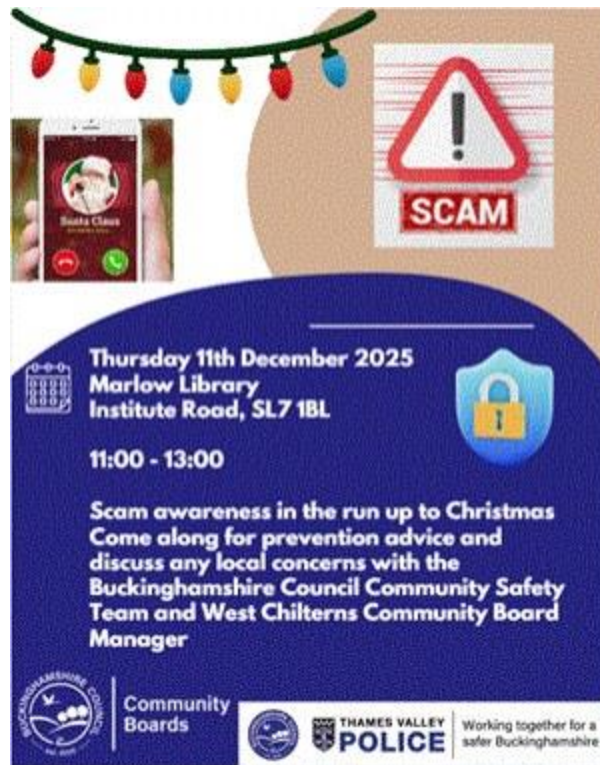
7 - Scam Awareness flyer